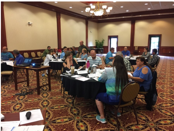
Pictured: PCQI Participants

The FDA will be enforcing the new requirements to the industry. In late September, Harvest NY in conjunction with the Cornell Dairy Foods Extension delivered their first Foreign Supplier Verification Programs course. The Foreign Supplier Verification