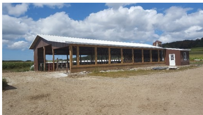
Figure 1- Converted machinery shed. Calf warming room on right

Working with Harvest NY, an underutilized machinery shed was converted to a cow-friendly, labor-minimized facility. A calf warming / vet supply room was added into the design. This will allow the dairyman to handle neonates and/or parturition emergencies quickly and effectively.