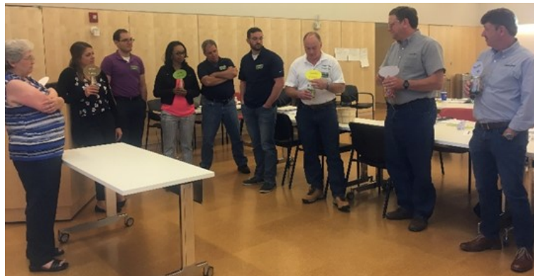
Pictured: PCQI Training

In August, the second FSMA for Animal Foods was hosted at Cornell, in collaboration with Cooperative Feed Dealers. Twelve industry leaders were trained to become PCQI (Preventive Controls Qualified Individual) to be compliant with the federal law.