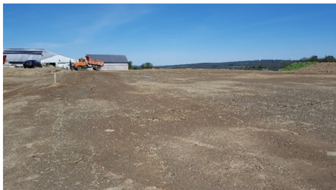
Figure 2- Site of new freestall barn in Wyoming County

(Wyoming Co.) Last quarter we reported on the design phase of a new freestall barn and its juxtaposition to existing facilities on the farmstead. This quarter, the farm broke ground on the site.