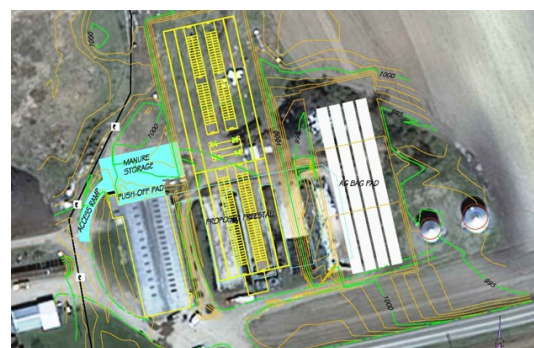
Figure 1— 10-year Farmstead Development Plan w/ BMP's Included Arkport, NY

Harvest NY continues to work with a number of farms, large and small, to develop long term strategic farm growth plans. Integral to this planning is the inclusion of the best management practices (BMP's) delineated in the farm's comprehensive nutrient management plan or CNMP. In recent quarters, Harvest NY has taken a more proactive approach by working directly with certified planners during the development stages of the CNMP. Utilizing topographic surveys, CADD software, and on-farm information the BMP's can be planned, sized, and located on scaled aerial maps for inclusion in the hard copy of the CNMP. Such planning ensures that the required BMP's not only meet regulatory standards, but that they also promote efficiency, stewardship, and sustainability. Moreover, the designs avoid hindrances to expansion and/or allow for the inclusion of new technologies.