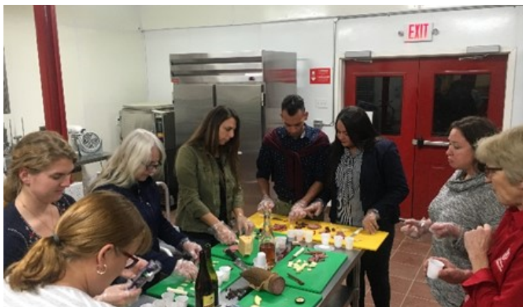
Charcuterie class at St. Lawrence CCE

November 4 marked the first charcuterie board class at the St. Lawrence CCE. These classes are targeted for consumers. Participants were able to taste test local meats and cheeses, and then were able to create a charcuterie board to become the talking point at holiday parties. All products used to create the boards were local meats (peperoni, sticks, sausages and salami) and local cheeses.